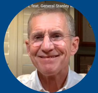
General Stanley McCrystal Speaking on Ending the Middle East Wars.