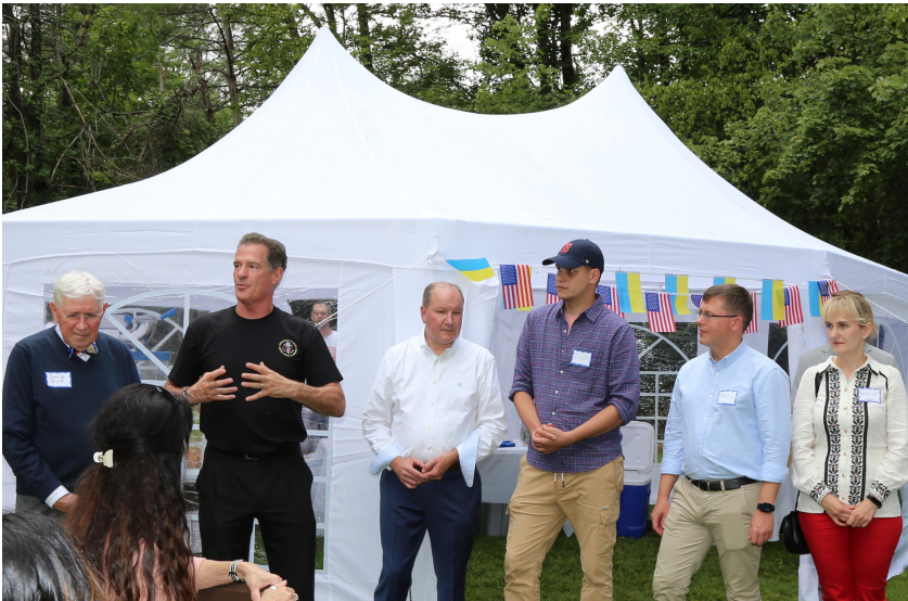
Members of Ukraine's Parliament Visited New Hampshire in July.

While the pandemic still rages across the world, WACNH and its partners remain vigilant about the safety of the community. It is not yet time to fully re-open for in-person hosting, but this little reminder of the power of these programs will help sustain the efforts of the Council while other exchanges remain online.