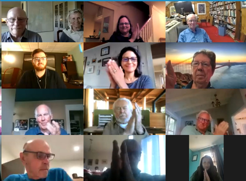
WACNH Annual Meeting Attendees Applaud the Council's Work