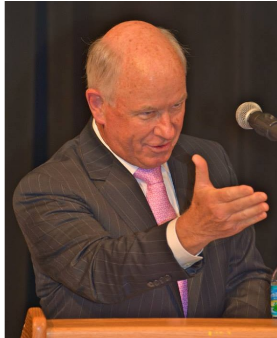
PJ Crowley, Former US Assistant Secretary of State for Public Affairs addressed Council members on current foreign policy challenges.