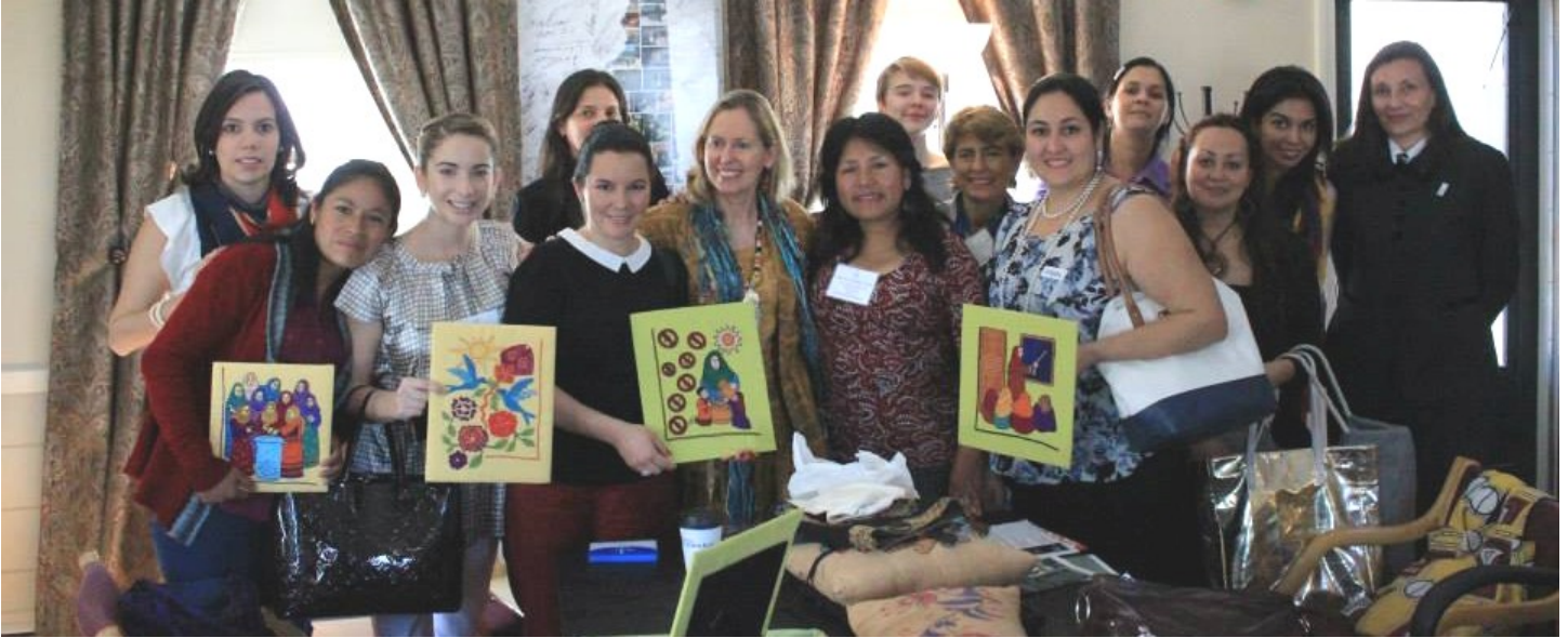
A delegation of entrepreneurs from Central and Southern America met with local non-profit Rubia to exchange ideas about supporting female business owners. (above)