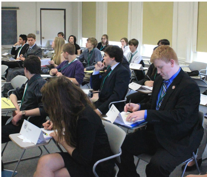
More than 100 students gained problem-solving and diplomacy skills at the 6th annual Plymouth Model UN Conference at Plymouth State University.